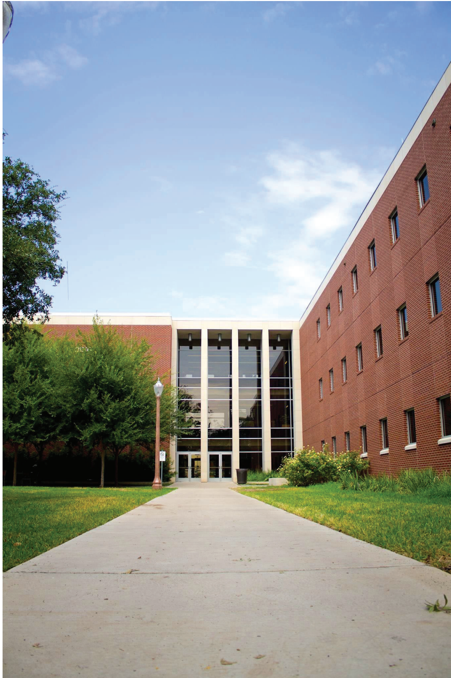
Figure 1: Marrs McLean Science Building.